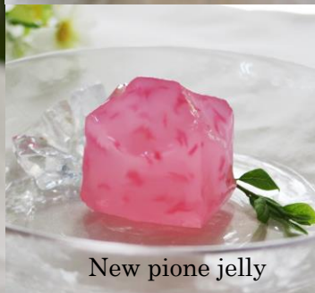
New Pione jelly